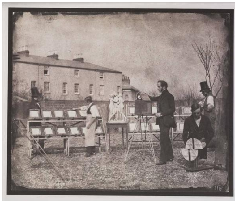
Fig. 5 The photographic establishment at Reading, c. 1846, salt print. Bradford: National Media Museum.