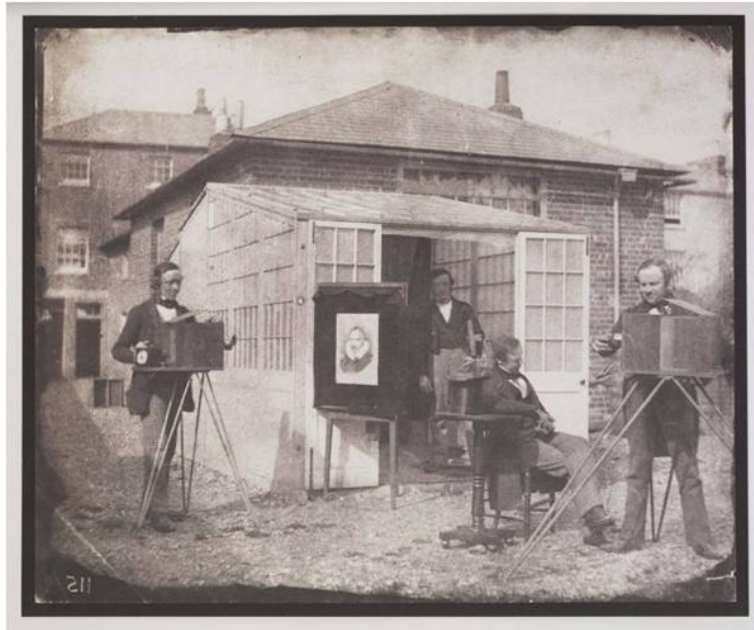
Fig. 4 The photographic establishment at Reading, c. 1846, salt print. Bradford: National Media Museum. © Science and Society Picture Library.

focimeter, to assist with focusing, is manipulated. 11 The views probably date from shortly before Stirling's commission for illustrations for the Annals , and it therefore seems particularly significant that two out of the three photographic shots shown being taken are demonstrations of photography of art.