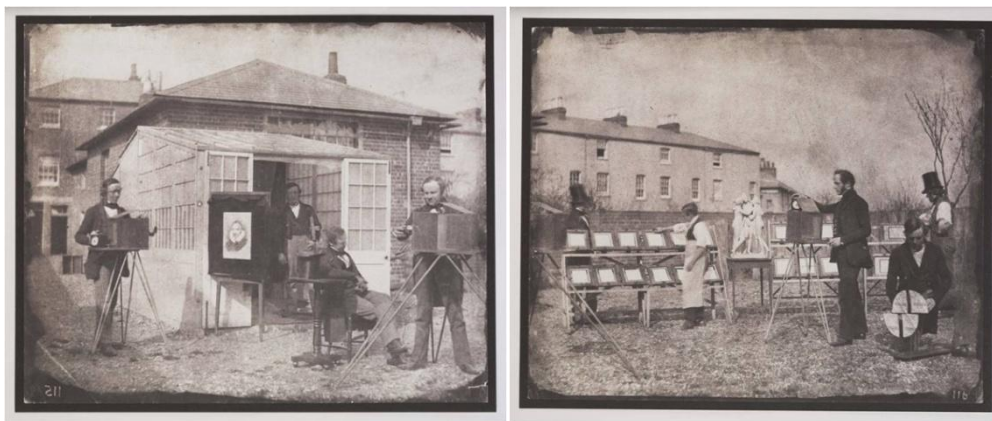
Fig. 3 The photographic establishment at Reading, c. 1846, salt prints. Bradford: National Media Museum. © Science and Society Picture Library.

The Annals Talbotypes were photographed in 1847-8, under Stirling’s direction and at his cost, by Nicolaas Henneman, Talbot’s principal pupil and assistant, who ran the first photographic establishment at Reading from 1844 and subsequently the Sun Picture Rooms which opened in Regent Street in London in 1847. Two Talbotype photographs make up a composite view showing photography taking place in the back garden of the Reading establishment (Fig. 3).