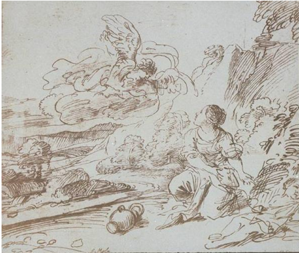
Fig. 1 William Henry Fox Talbot, The Pencil of Nature, London: Longman, Brown, Green and Longman's, Part 6, April 1846, Plate XXIII. Lithograph by Johann Nepomuk Strixner after Pier Francesco Mola, Hagar in the desert, ink and chalk on paper. Unbound salt print. Bradford: National Media Museum.

photographic illustrations of Spanish paintings, prints and sculpture, by artists including El Greco, Velázquez, Murillo, Zurbarán, and Ribera, in addition to Goya prints, and examples of architectural designs and book illustrations. 6