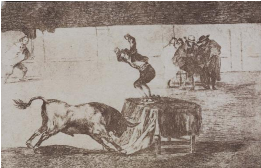
Fig. 8 Nicolaas Henneman, Talbotype Illustrations to the Annals of the Artists of Spain , London: privately published, [1847-8], no. 63: Francisco de Goya, An exploit of Martincho in the bull-ring of Zaragoza , etching and aquatint, Tauromaquia , Madrid: [1816], no. 19. Unbound salt print. Bradford: National Media Museum.

One of the most important resources being exploited for the project are the holdings relating to Talbot and Talbotypes which are now in the National Media Museum. These include the unbound photographic prints that remained in Henneman's studio after the fifty copies of the Annals Talbotypes volume were made up. 15 Many of these salt prints were clearly studio rejects, either because they were too light, too dark or had other chemical or physical defects, such as tears, hairs or fingerprints, though these too are now valuable for the insight they provide into the process and the workings of the studio. Not all were regarded as failures, however – then or now: indeed, a large number are in far better condition today than those in surviving bound volumes, apparently because they have not been exposed to the same range of causes of environmental and chemical damage. It is, therefore, anticipated that a number of the Talbotypes reproduced in the facsimile will be taken from National Media Museum holdings.