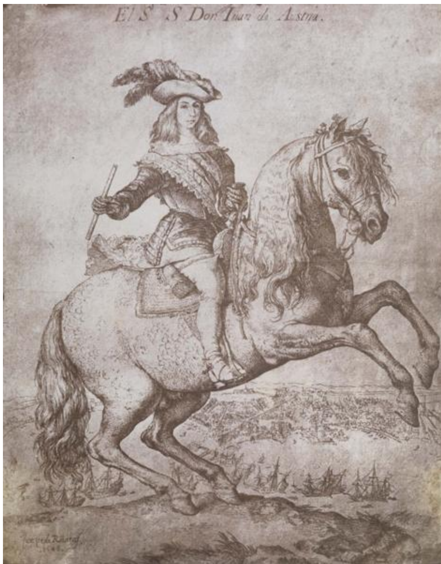
Fig. 11 Nicolaas Henneman, Talbotype Illustrations to the Annals of the Artists of Spain , London: privately printed, [1847-8], no. 37: José de Ribera, Don John of Austria , etching. Unbound salt print. Bradford: National Media Museum.

Amongst the most fascinating examples of prints after paintings in the Annals Talbotypes are those of four of the early etchings by Goya after Velázquez's equestrian portraits (nos. 26-9), which serve as illustrations of the work of both artists, and as a record of the later artist's admiration for his seventeenth-century predecessor as court painter. Together with the Tauromaquia subjects (nos. 63-5), there were a total of seven Goya prints reproduced in the Talbotypes volume. Two of the Caprichos were also illustrated as wood engravings in the text volumes, and meant that the Annals provided an important boost to the artist's fame in Britain.