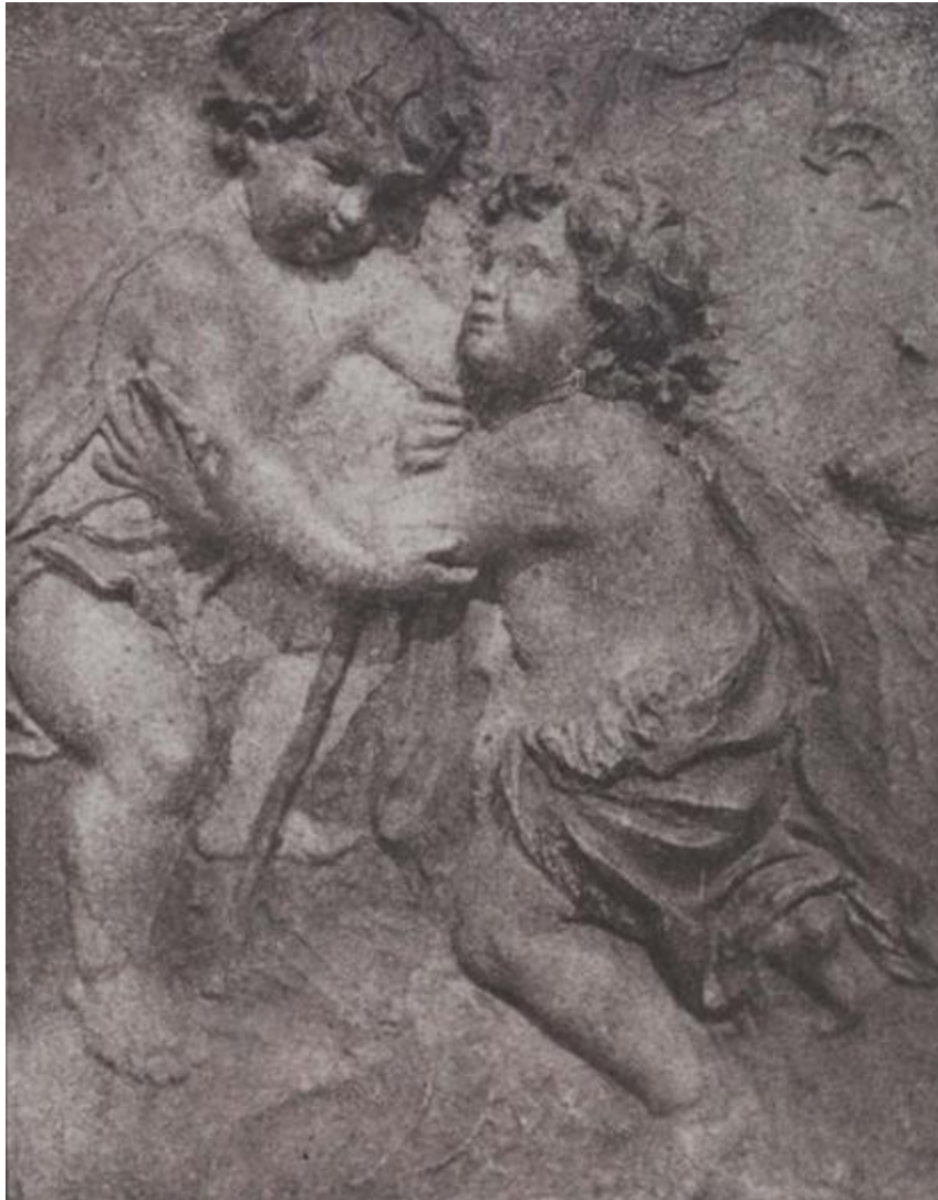
Fig. 10 Nicolaas Henneman, Talbotype Illustrations to the Annals of the Artists of Spain , London: privately printed, [1847-8], no. 13: Juan Martínez Montañés, Christ Child and Infant St John , sculpture relief, Ford collection, London. Unbound salt print. Bradford: National Media Museum.

A number of the untrimmed salt prints in the Museum's collection also provide fascinating evidence of the circumstances and physical environment in which the photographs were taken. Fig. 9, for example, shows a drawing by M. Tessin after a Self-Portrait in oils by Pedro Orrente (no. 12). This was one of the illustrations for the Annals commissioned by Stirling in 1844-46, when the original (now in the Prado) hung in the Louvre as part of King Louis-Philippe's Galerie espagnole . Here, the drawing is shown pinned to a board, rather like the portrait in the view of the Reading establishment, and in this case backed by a copy of Punch .