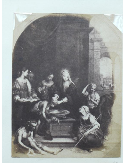
Fig. 6 Nicolaas Henneman, Talbotype Illustrations to the Annals of the Artists of Spain , London: privately printed, [1847-8], no. 42: lithograph after Bartolomé Esteban Murillo, St Elizabeth of Hungary . Salt print.