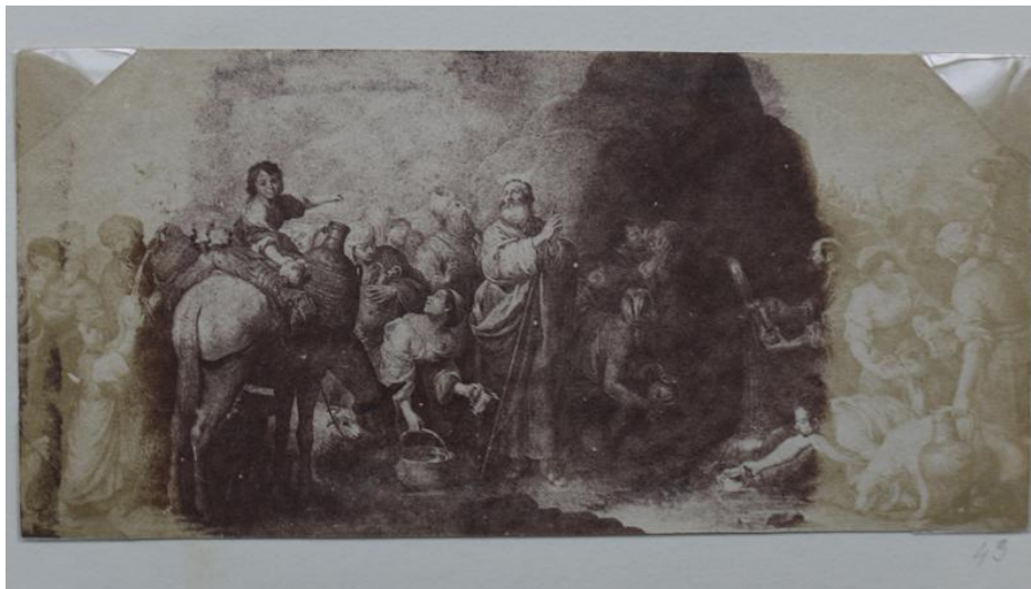
Fig. 7 Nicolaas Henneman, Talbotype Illustrations to the Annals of the Artists of Spain , London: privately printed, [1847-8], no. 43: engraving by Rafael Esteve after Bartolomé Esteban Murillo, Moses striking the rock . Salt print.

The difficulties experienced in producing the Annals Talbotypes, however, reveal the many limitations the new process presented as a method of reproducing art. Chemically, Talbotypes were unstable, and are thought to have been affected by a number of factors, including daylight, and the paper, water and glue used. 12 One